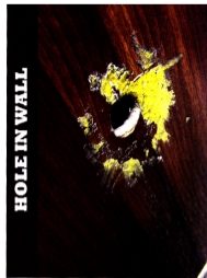
VANDALISM: Partition hole that was glued shut and then ripped open.

"I hate it that the men are around all day and they look at you like prey to be eaten. The men who visit those holes are sick."