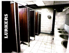
WHAT'S GOING ON?: Some occupy the same cubicle for hours.