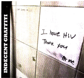
GROSS: Obscene proposals are scribbled in this third-storey too.